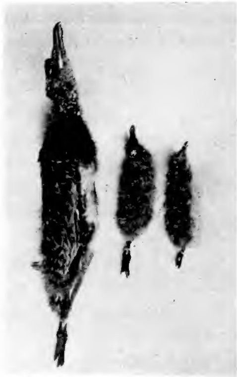
Figure 55. Black-tailed Gull chicks – less than actual size. From Right: 1. About 3 or 4 day old chick; 2. About 1 week old chick; 3. About 3 week old chick.